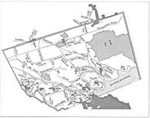
DICKIE BRIDGE Printable Map